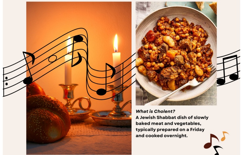
What is Cholent? A Jewish Shabbat dish of slowly baked meat and vegetables, typically prepared on a Friday and cooked overnight.

Prepare for Shabbat with a night of COMMUNAL SINGING, LEARNING, CHOLENT & L'CHAYIMS!